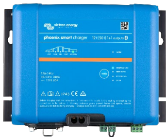
Smart IP43 Charger 12/50 (1+1)