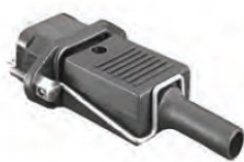
Retainer clip (included)